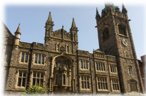
The Assembly Buildings in Belfast City Centre