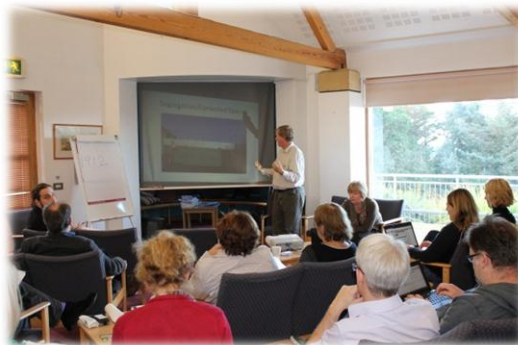
EUROCLIO's seminar in Corrymeela, Northern Ireland, September 2012