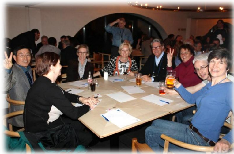
Participants during the International Pub Quiz in Helsingor