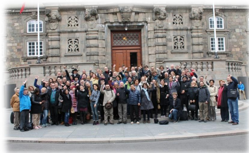
EUROCLIO's 22nd Annual Conference in Denmark

Establishment of History Teachers Association of Northern Ireland