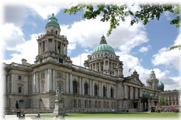
Belfast City Hall